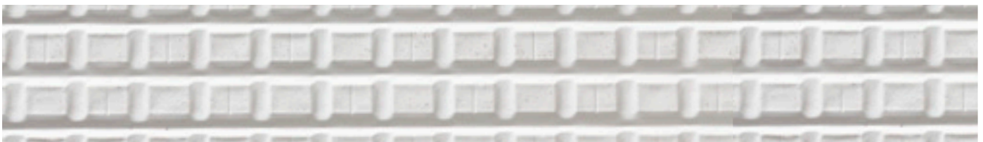
metalflexSBS® Cool White 24